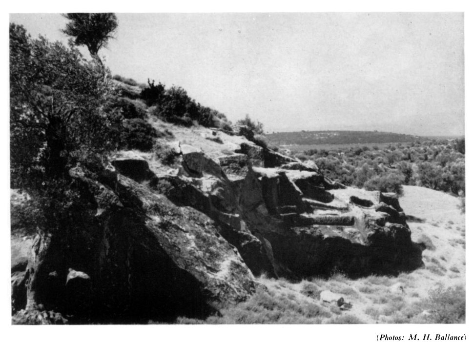
b. TEOS. THE NORTH-WEST QUARRY, LOOKING WEST (pp. 79-81)